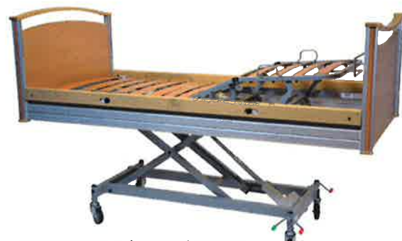
Foot support in the raised position

The beds in the pictures is equipped with bed frame ONYX 4-40.