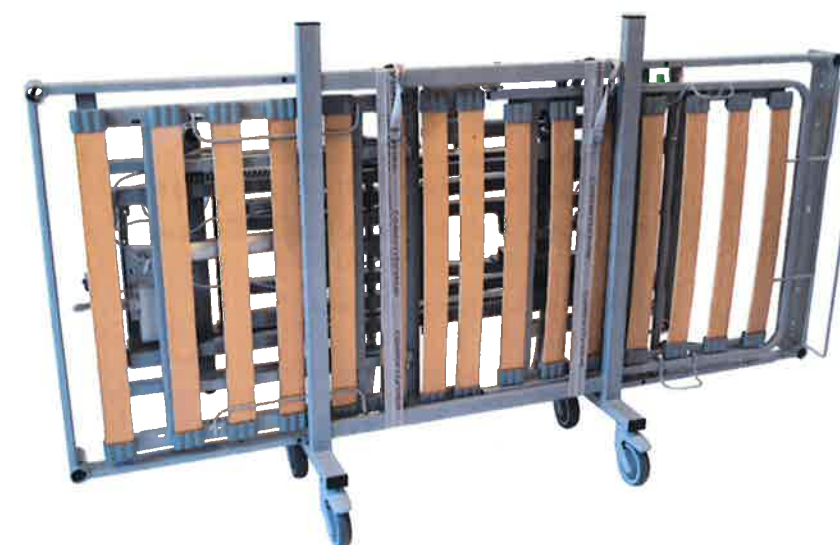
The bed can be transported and stored using a bed transport wagon, a method that works very well for staff.

QVINTETT H is constructed for easy transport and storage of the bed. The bed frame can easily and simply with out tools is divided into 3 parts, which makes for easy assembly and delivery of the bed. Although it is not necessary to transport the bed divided. Can be delivered just as easy on a transport wagon.