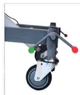
Central locking wheels with ergonomic pedals.

The beds in the pictures is equipped with bed frame ONYX 4-40.