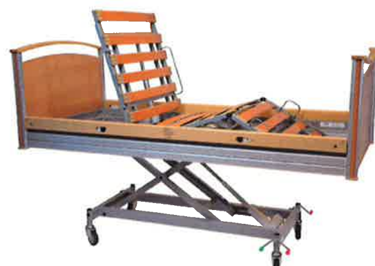
Sitting position with foot rest under the horizontal position.