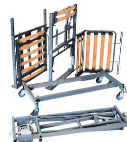
Bed and bed lift in unassembled state.