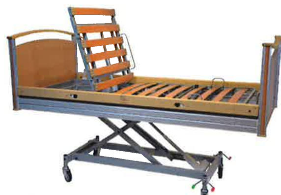
Active back in the upright position

Both the model QVINTETT A and the QVINTETT H give a variety of functions that are easily adjusted with the hand control. Please note that in the sitting position the foot rest goes under horizontal.