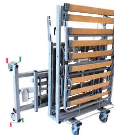
Can be transported with a vertical bed lift.

The bed can be easily divided and packed onto a special bed wagon making it into a unit easily transportable and with a storage area of only 50 x 90 cm with a depth less than 0.5 cm.