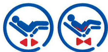
Active support system reduces pressure on the patient.

The beds back support is active, which means when the back support is raised it lifts upwards and backwards thus reducing the shearing.